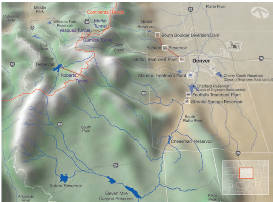
Denver Water's collection system covers about 4,000 square miles and extends into more than eight counties.

Denver Water vigilantly safeguards our mountain water supplies, and the water is carefully treated before it reaches your tap. This brochure provides data collected throughout 2018.